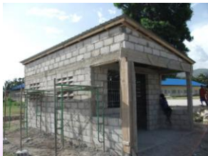
House we built