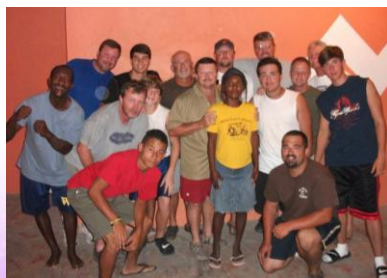
The Construction Crew with the recipient of the House