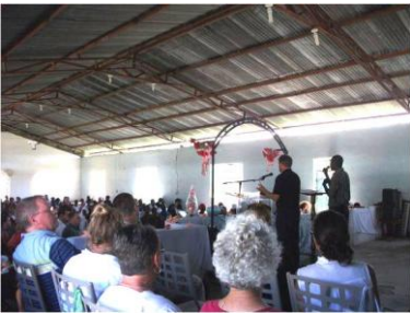
Worship with the Haitians

A Special thank you to all our Prayer Warriors! We could feel your prayers! Thank you for praying for us!