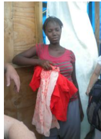
Young Lady saved during Tent Outreach